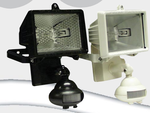
BLACK LY20-010-12 WHITE LY20-011-13

outdoor with light control Mini Halogen Light with Motion Sensor