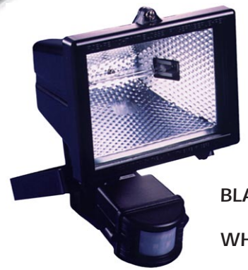
BLACK LY20-004-14 WHITE LY20-013-15

halogen light control Motion Sensor for Automatic Light Switching