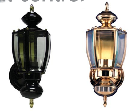
BLACK LY20-012-14 BRASS LY20-008-18

Highly efficient period design lantern with PIR